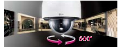
Max. 500°/sec HIGH SPEED PANNING & TILTING

The PTZ camera, it quickly and thoroughly monitors the preset areas through endless high-speed panning and tilting functions.