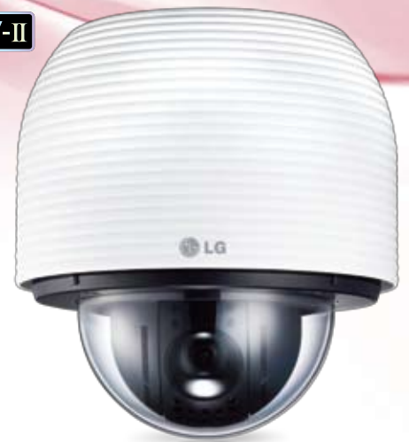
LNP3700T / LNP2800 (Outdoor)